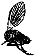
Adult Drain Fly

Adult drain flies are tiny and very hairy with pointed wings. The wings are held roof-like over the body when at rest. They are weak fliers and often appear to be jumping or hopping. Flight and mating activities normally occur in the evening hours when they are attracted to lights. Each female can produce about one hundred eggs.